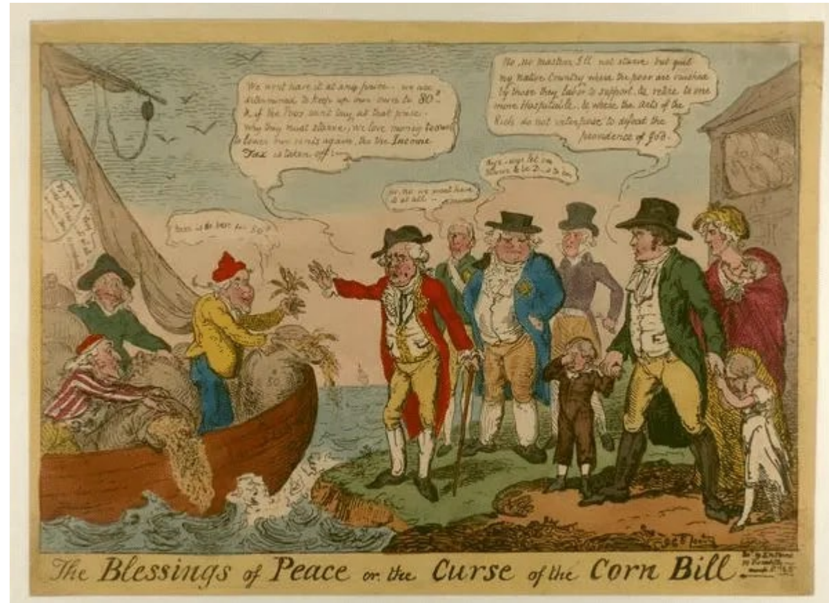
Repeal of the Corn Laws

The Political Economy of the New Gilded Age