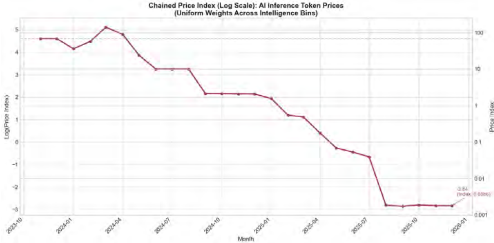
Figure 2: Chained Fisher Price Index for AI inference tokens at constant capability. The index tracks the minimum price per million tokens within each intelligence tier and chains them into a single quality-adjusted series. The rapid decline reflects falling inference costs at fixed model capability, not a shift toward lower-capability models.

Training output and its price deflator. To price-adjust training production, we apply the pace of algorithmic improvement estimated by Ho et al. (2024) , who find that the compute required to train a model at fixed performance falls by roughly two thirds each year—an annualized efficiency gain of approximately 65%, or a 3\times increase in effective compute per unit of physical compute.